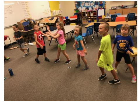
Students dancing along to Just Dance .